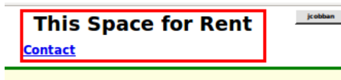
Illustration 1: Advertisement

To support the continued operation of the web-site I am soliciting advertising. A space is reserved at the top and bottom of every page for advertising. The bottom space currently displays the Facebook Like button. The top currently displays an invitation to advertise.