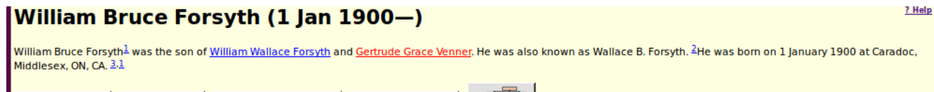
Illustration 3: Order of Information Display Changed for Individual

If you are signed on as a registered user, the popup containing information about a specific location that appears if you hold the mouse over a location name now contains a button that permits you to edit the description of the location. As a registered subscriber you can change any information about a location, including the spelling and capitalization of the name, the geographic coordinates, the boundary of administrative areas such as townships, counties, and states, and the descriptive text.